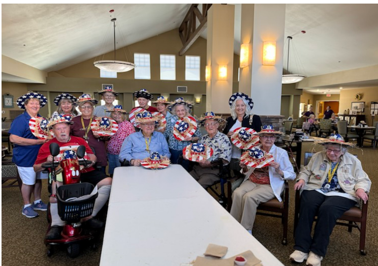
Mesa Valley Estates resident Veterans with VVDAR members showing off their cowboy hat centerpieces