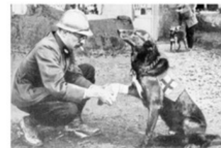
Struck by stray bullet searching for wounded, with Army doctor

By 1916, the trench warfare along the Western Front, had created an impenetrable thicket of barbed wire and landmines. Communication and supply lines to the West were tenuous at best. Rescuing the wounded and delivering needed food and armaments to the troops along the western-most lines was a perilous undertaking. The solution to some of these challenges was the creation of a canine corps, or “War Dogs.” These dogs became prized for their abilities to maneuver through the treacherous terrain, ensuring rapid communications, essential provisioning, and arming, and providing search and rescue services.