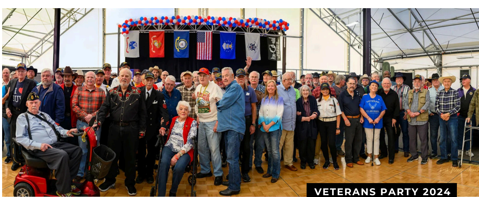
VETERANS PARTY 2024